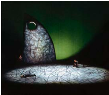
Tristan — Wieland Wagner (1962)