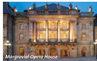
Margravian Opera House