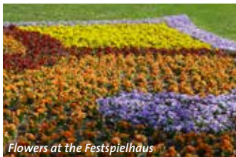
Flowers at the Festspielhaus