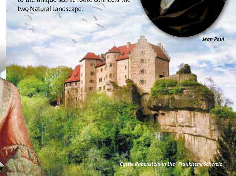
Castle Rabenstein in the “Fränkische Schweiz”